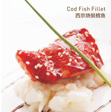
Cod Fish Fillet 西京烧银鳕鱼