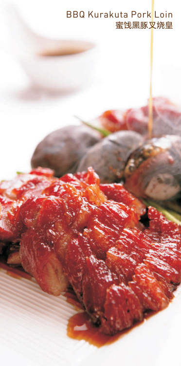
BBQ Kurakuta Pork Loin 蜜饯黑豚叉烧皇