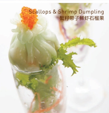
Scallops & Shrimp Dumpling 蟹籽带子鲜虾石榴果