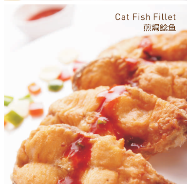
Cat Fish Fillet 煎焗鲷鱼