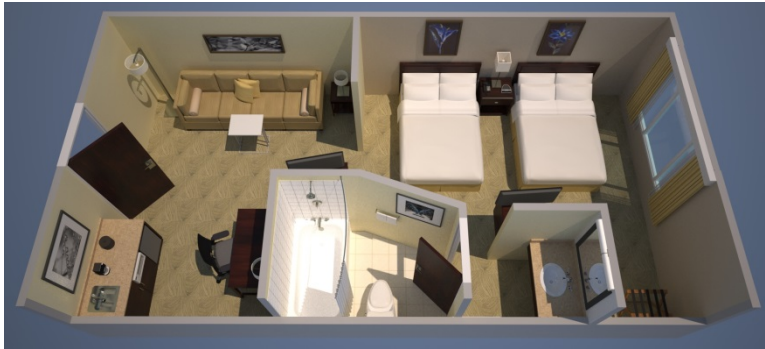
Studio – 2 Double