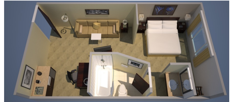
Studio – 1 King