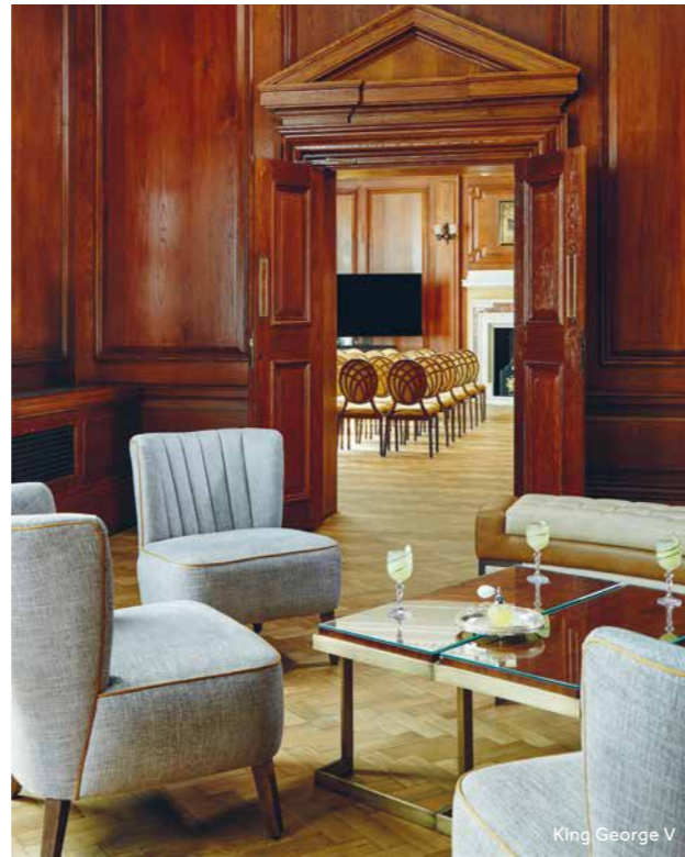
King George V

It is this seamless blend of historic charm and thoughtful, modern convenience that sets London Marriott Hotel County Hall apart, both as a hotel and a meetings and events destination. Add to that our incredible riverside location, offering uninterrupted views of Big Ben and the Houses of Parliament, and you have a truly compelling experience to offer your guests.