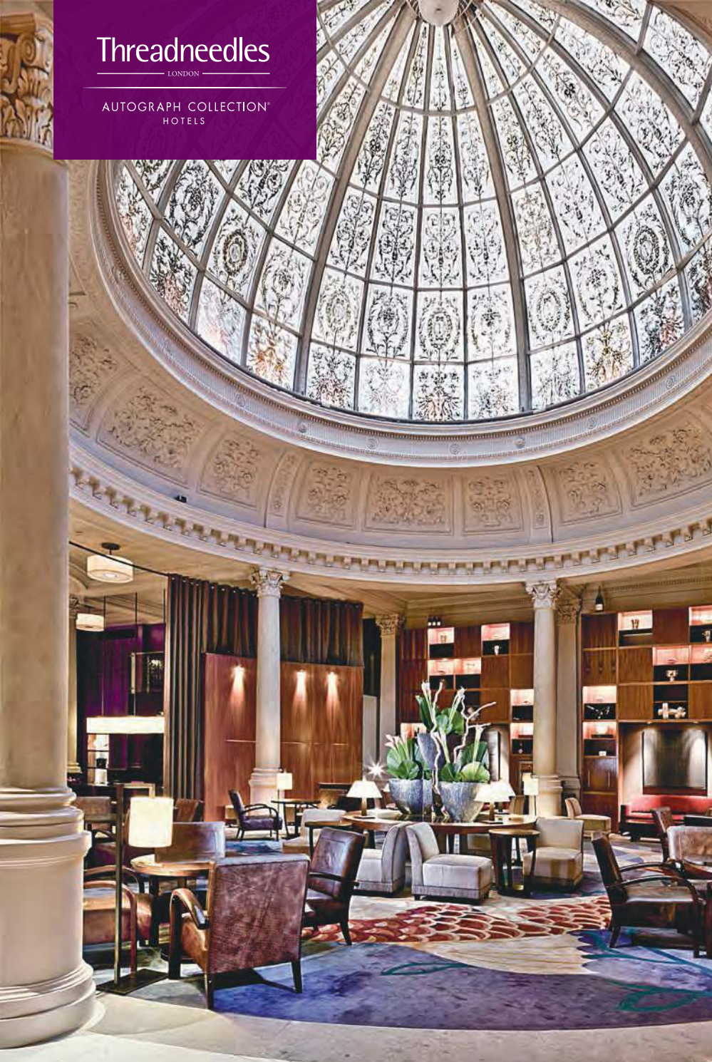
The Autograph Collection, by Marriott International, is an evolving ensemble of strikingly independent hotels.