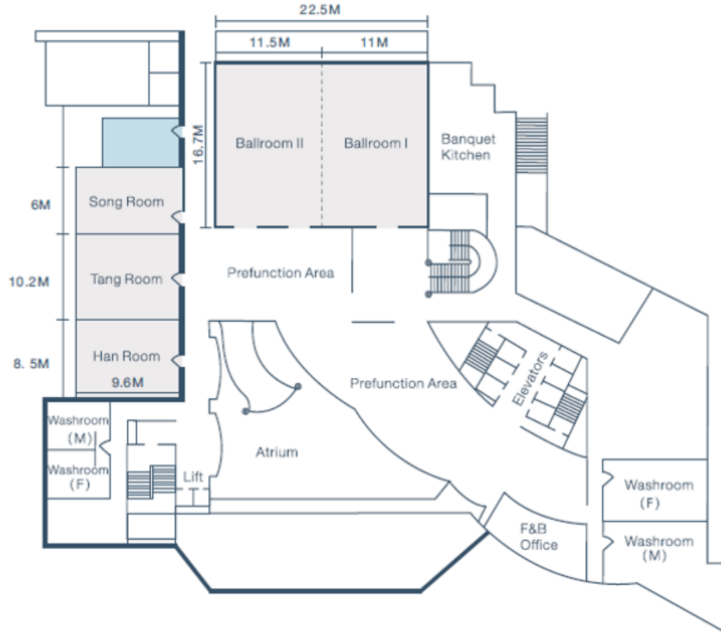
3F FLOOR PLAN