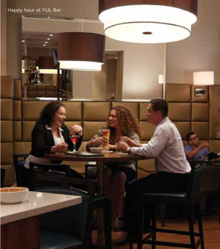
Happy hour at YUL Bar