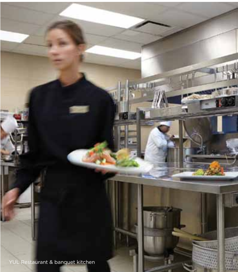
YUL Restaurant & banquet kitchen