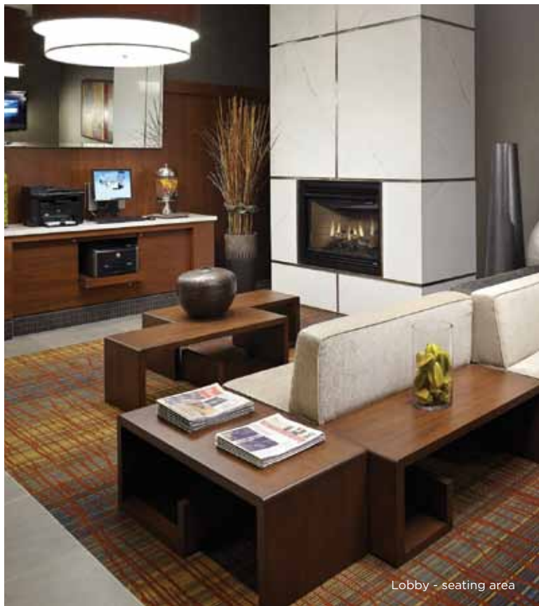
Lobby - seating area