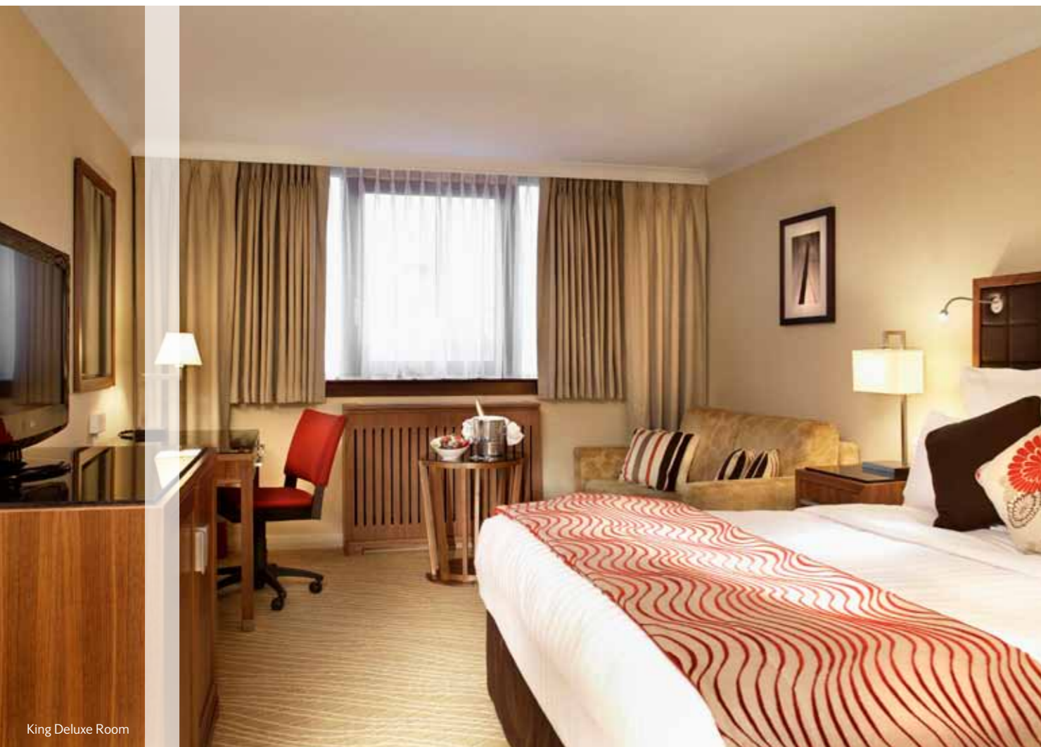
King Deluxe Room