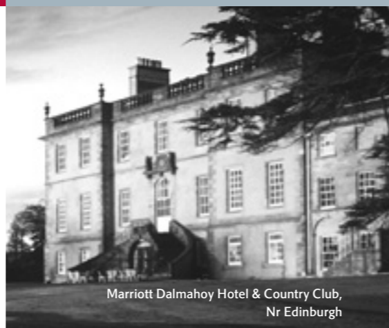
Marriott Dalmahoy Hotel & Country Club, Nr Edinburgh

Y our honeymoon is the idyllic start to your new life together. Continue the fairytale of the perfect day with the perfect honeymoon at any of our 2,800 hotels worldwide, including a choice of over 70 hotels across the UK and Ireland.