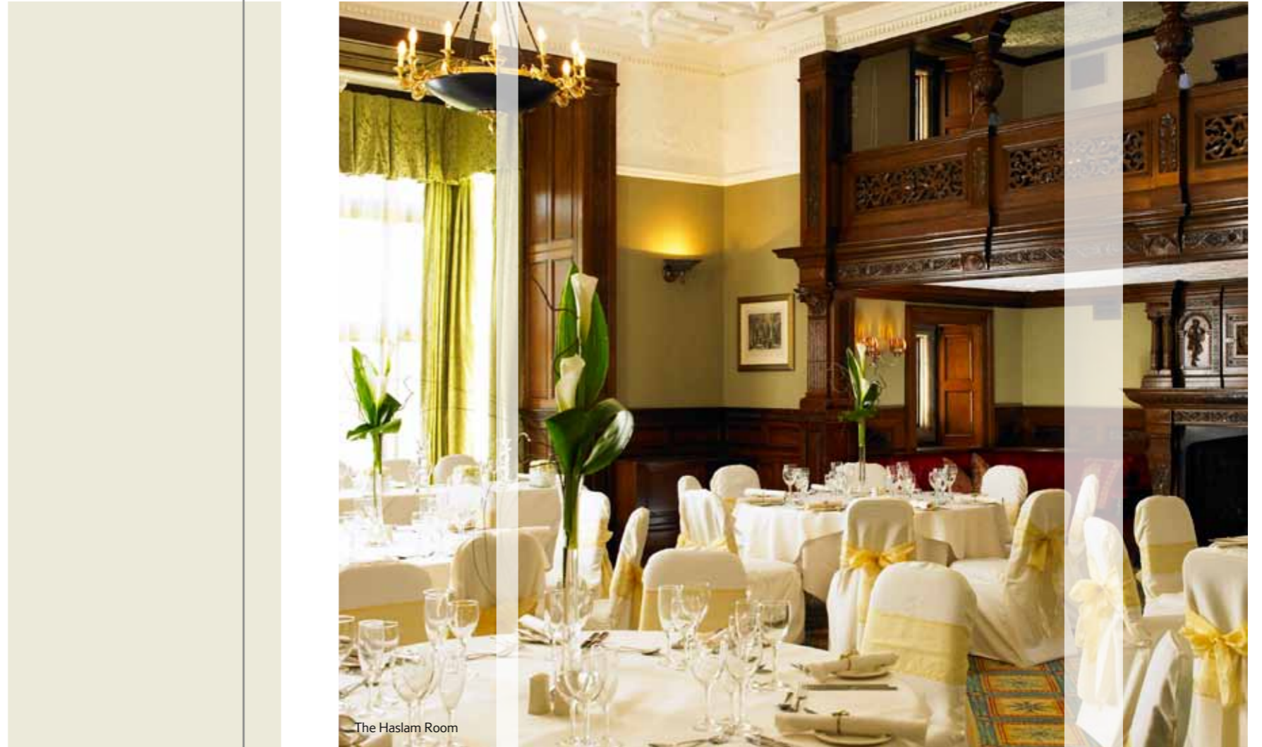
The Haslam Room