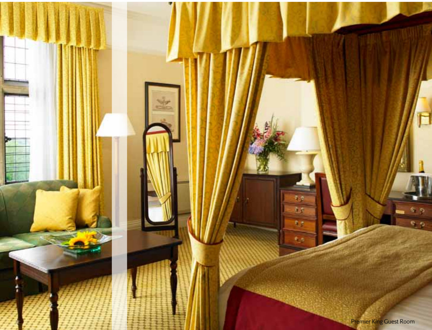
Premier King Guest Room