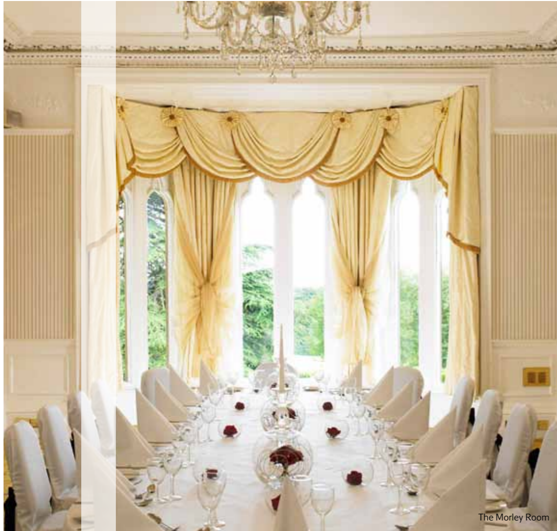
The Morley Room

I do not expect you to fulfil all my dreams, only to share them, and allow me to share yours.