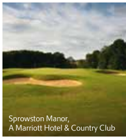
Sprowston Manor, A Marriott Hotel & Country Club