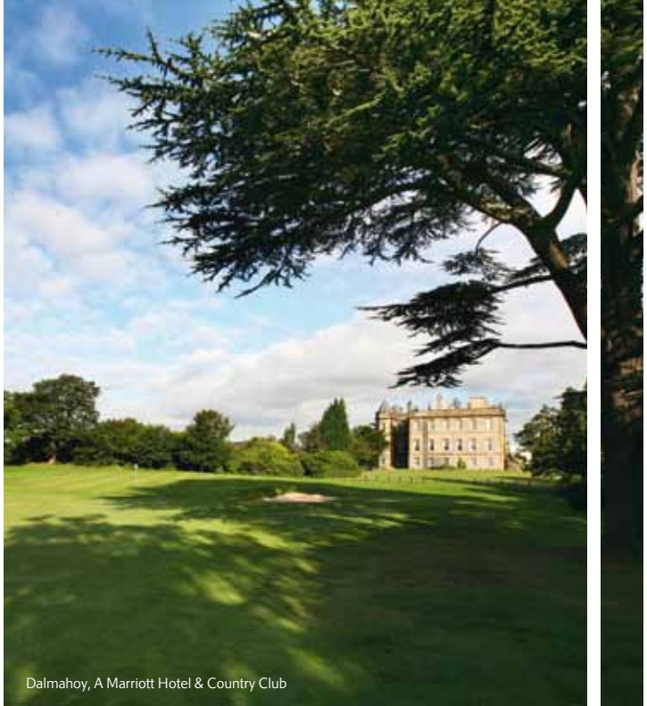
Dalmahoy, A Marriott Hotel & Country Club