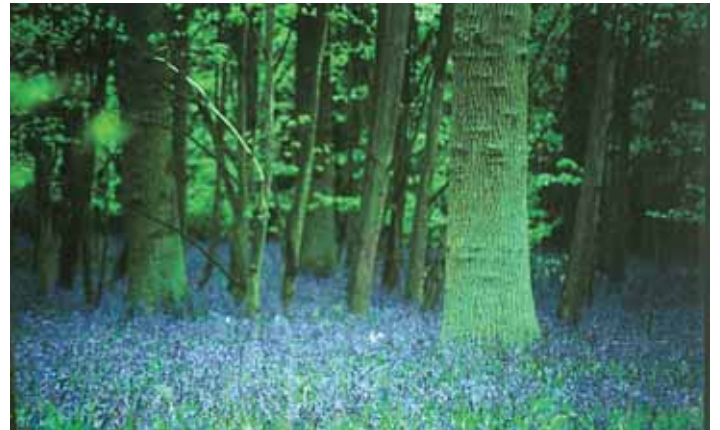
Grafham Water Nature Reserve

10 Just after passing the 'Huntingdonshire' sign, turn R onto Hatchett Lane (NS). Alternatively if you want to visit the village of Kimbolton, then continue SA to the T-j, where you turn L. Please take extra care as the B660/B645 can be busy at this point. You might prefer to dismount from your cycle and walk along the pavement, which starts to the L of this junction. ⚠