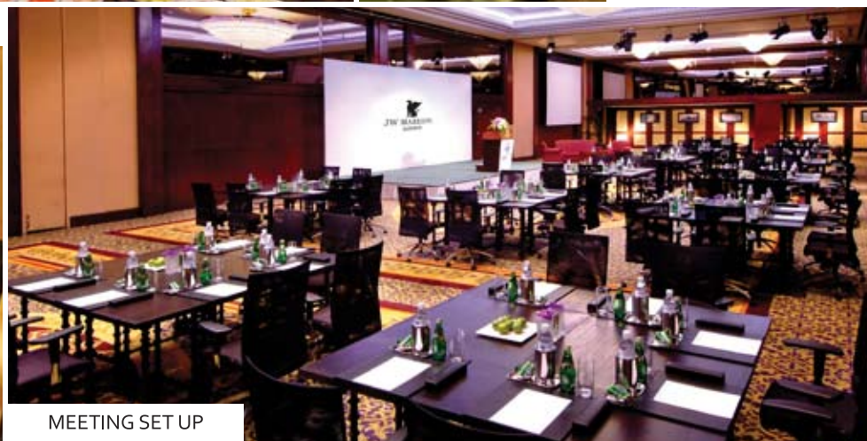
MEETING SET UP

The award-winning 5-star JW Marriott Bangkok is situated in the heart of the business, entertainment and shopping district, and offers an extensive selection of culinary options to suit the most discerning tastes. With high-speed internet and the new remote Jack Pack to stay connected both locally and internationally. The JW Marriott Bangkok is the hotel of choice for groups that wish to stay a step ahead.