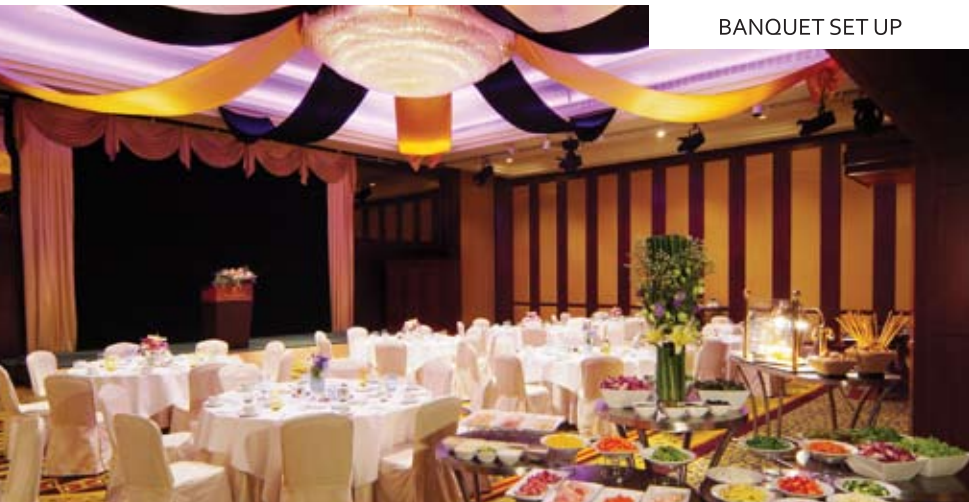
BANQUET SET UP